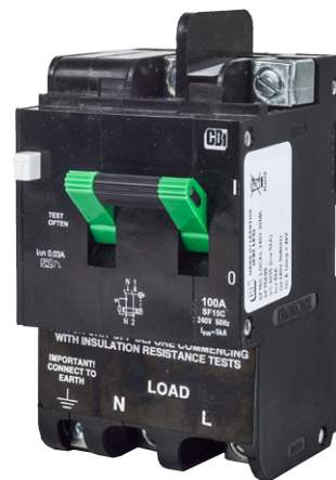
SF15C Mini Rail & Surface Mount