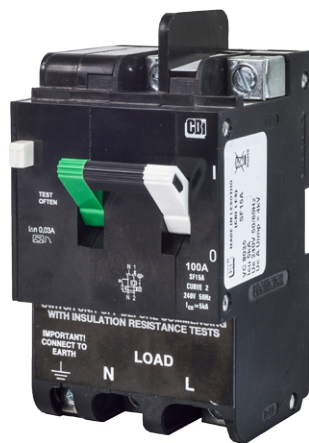
SF15A Mini Rail & Surface Mount

The SF15 is a single phase heavy duty industrial earth leakage circuit breaker available as a surface mount and CBI Mini Rail mount device. This earth leakage circuit breaker is available with earth leakage sensitivity of 30 mA.