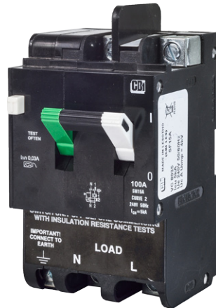
SM15A Mini Rail & Surface Mount

The SM15 is a single phase heavy duty industrial earth leakage circuit breaker available as a surface mount and CBI Mini Rail mount device. This earth leakage circuit breaker is available with earth leakage sensitivity of 30, 50, 100, 250, 375, 500 and 1000 mA.