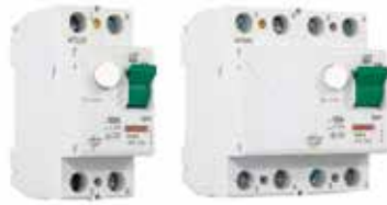
QF16C-D 100 A QF36C-D 100 A