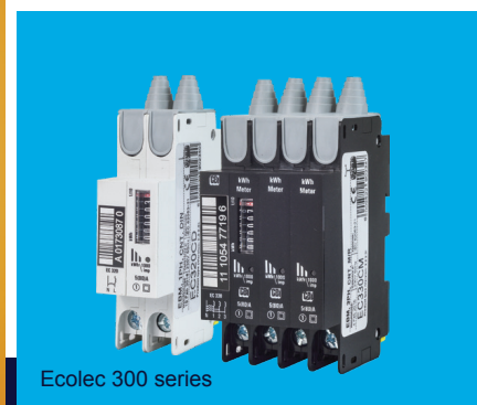
Ecolec 300 series

Big or small we have an energy management solution that will work for your business