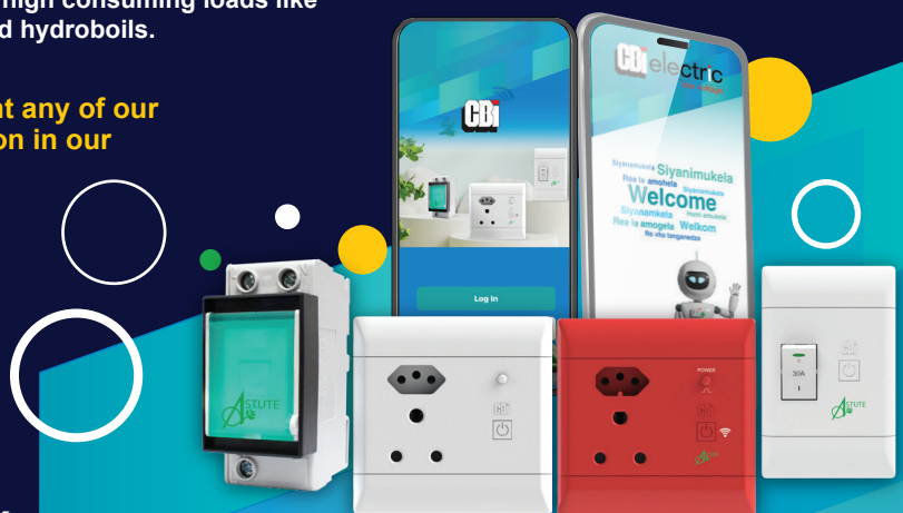
Astute Smart Range Astute - “Living a smart future”

Collectively “keepin' it Lit” - to minimise loadshedding within our shared electrical network