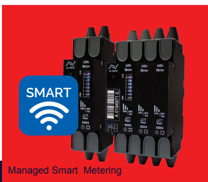
Managed Smart Metering